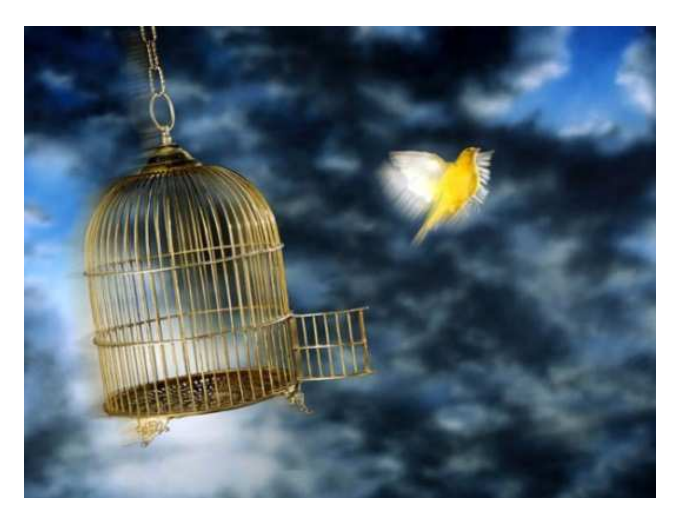
Never - ever, ever, ever, ever - give up! (Winston Churchill)

ups and downs. I too had my weak moments, but if you realise that it is temporarily and that it will get better and better in time, you always have enough power and motivation to go on and on. Nothing is more important than your health. In time your dips will get less and less and finally disappear. Accept them as natural parts of this period. If you fall, just get back on your feet and go on.