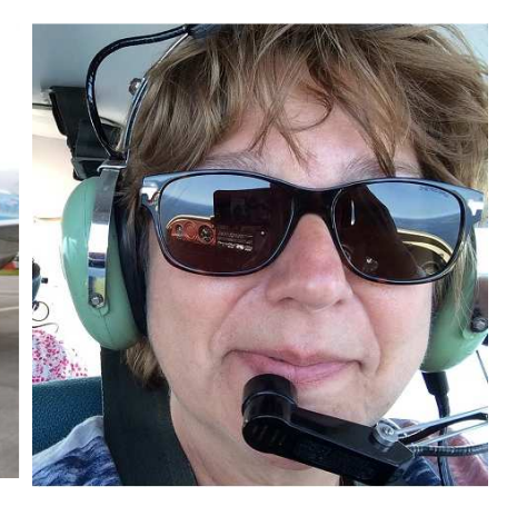
2010 August -My first dining out after 10 years.